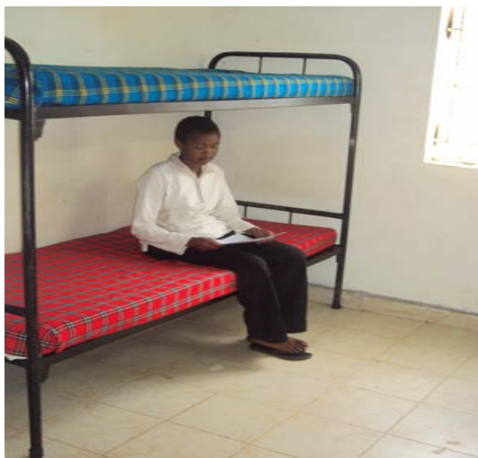
Student in a Double room